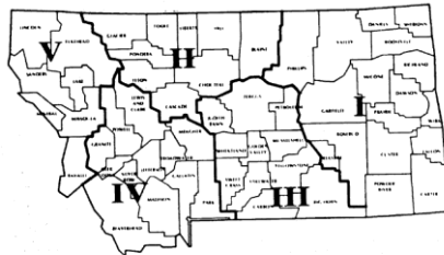
Montana CSPD Regions